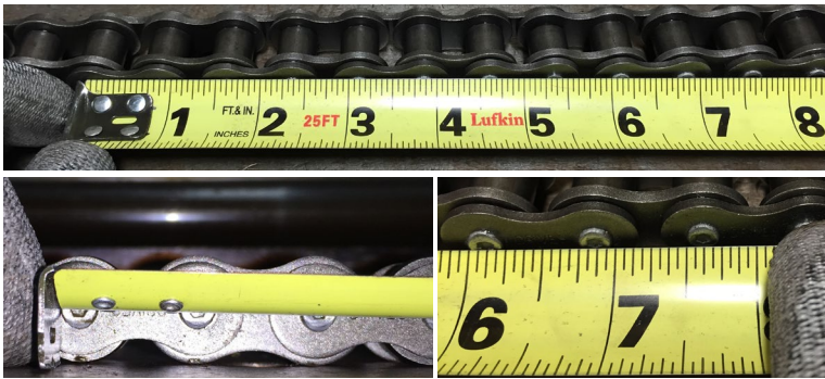
Figure 2: Measuring 10 Pitches of 60-1 Chain with a Tape Measure