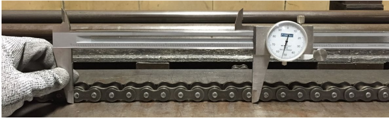
Figure 1: Measuring 10 Pitch Section with a Caliper