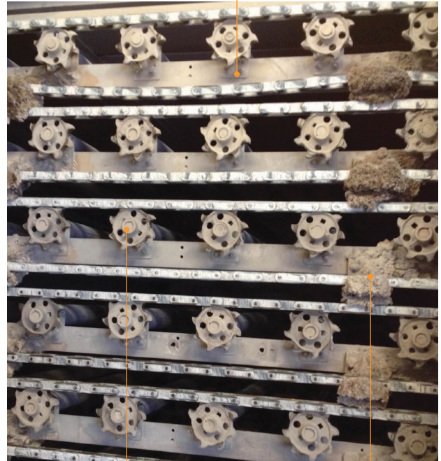
Hook-tooth sprockets rotate the rollers in the oven