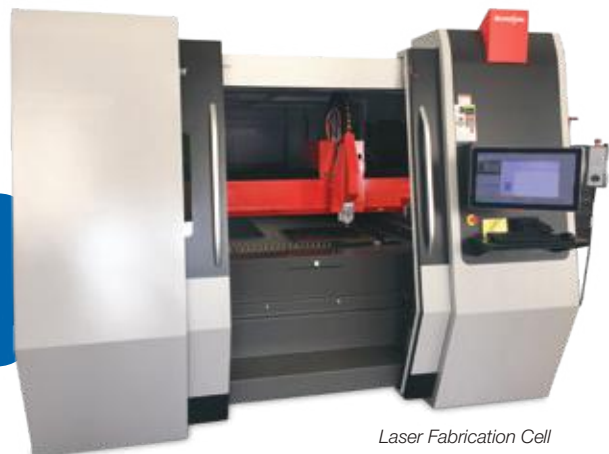
Laser Fabrication Cell

The laser fabrication cell replaces the need for a traditional punch press for component fabrication. Tooling may be required for bent attachments.